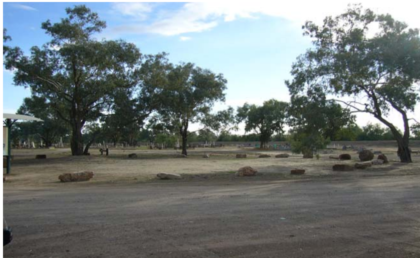
Photo showing area originally proposed to be reduced