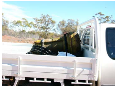
Hire pump from KSB being delivered.

Unfortunately within hours vandals started undoing the clips on the pipeline, allowing a small amount of sewage to spill into the laneway. Bourke police were immediately contacted and requested to patrol the area as often as possible. The W&WW Crew cleaned up the sewage and wired up the clips and bound them with tape. The vandals then threw objects, including witches hats down the manholes, blocking the sewer pipelines. A wrecked pushbike was also removed from one of the manholes. Unfortunately it was unrideable and had to be dumped. A W&WW Crew spent almost a day using the Seka machine freeing the blockages in the sewer mains.