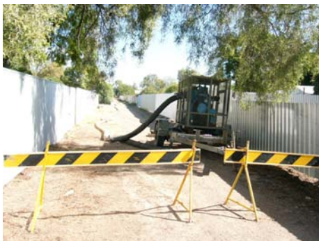
Emergency Pump at Becker St Lane delivered.

A hire pump was organised and was immediately shipped to Dubbo where it was picked up by Council Staff and installed. A new pump has been ordered and advice received from KSB Ajax indicates that it will take 4 to 8 weeks for delivery.